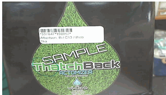
Package received -labeling COC