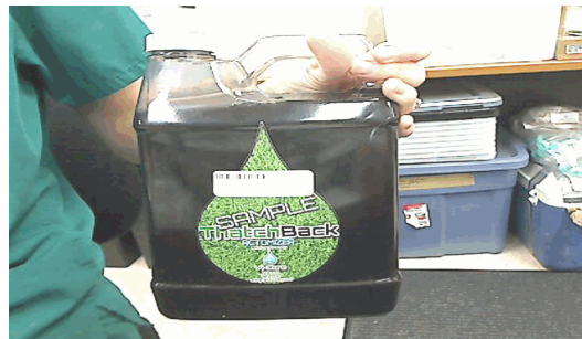
View of package #2